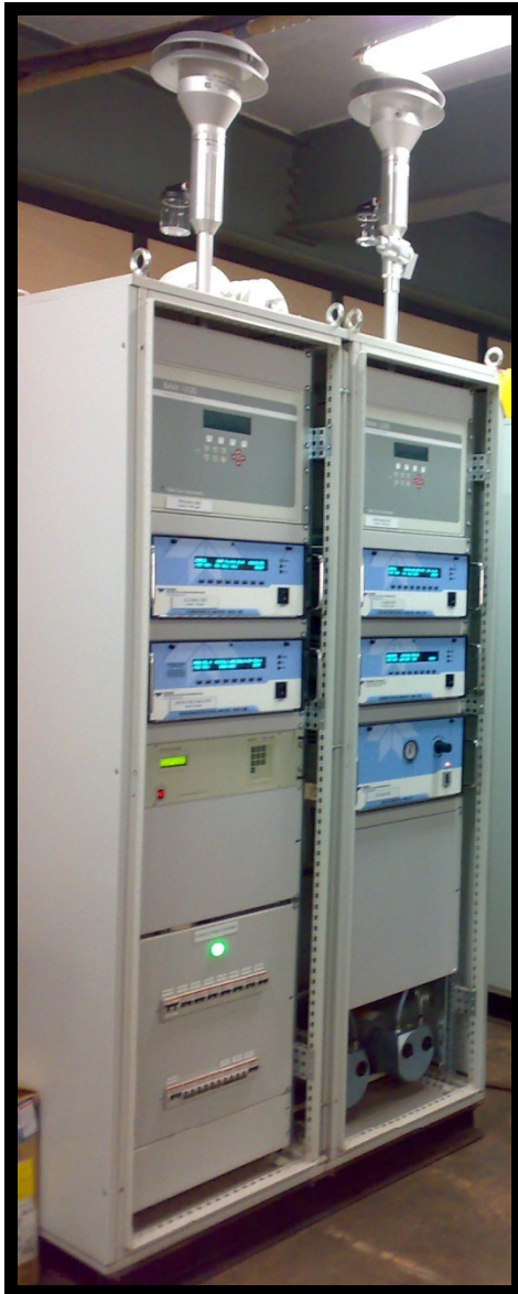
Ambient Analyzers mounted on Rack