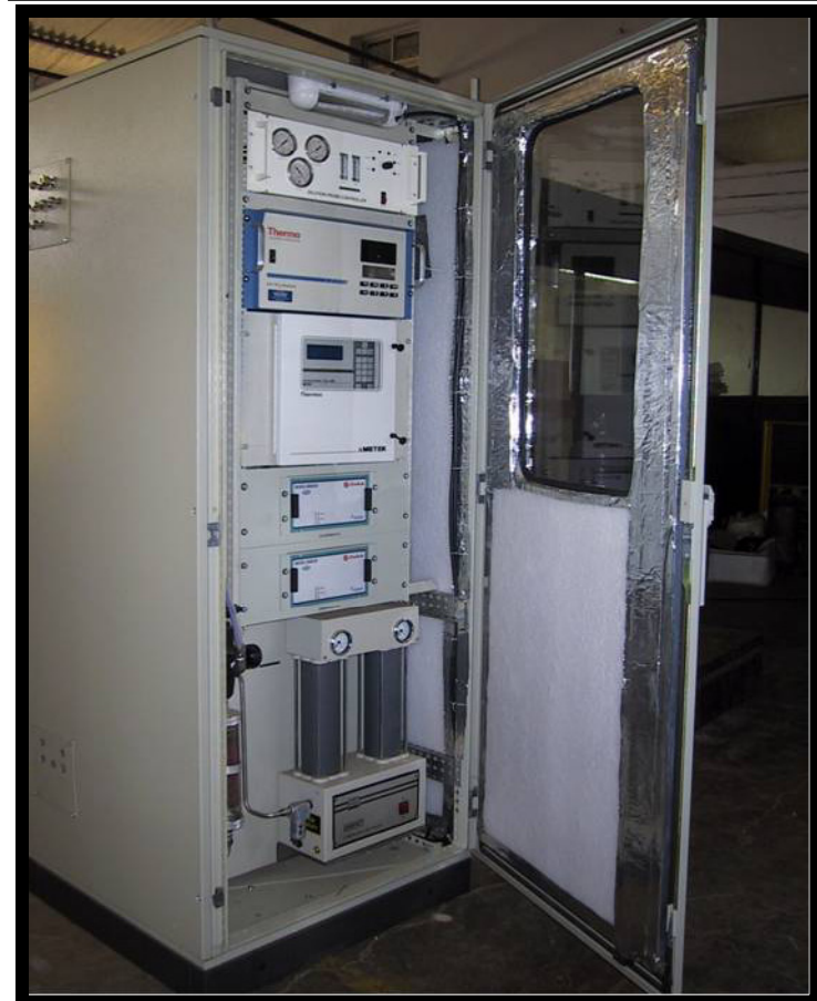
CEMS with Cabinet