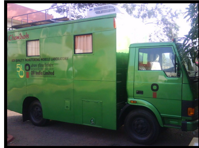
Mobile Air Quality Monitoring System